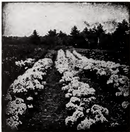
A Field of Phlox

Jeanne D'Arc or Snow Queen. Undoubtedly the very finest pure white variety to date. The plants are extra strong growers. 25 cents each, $2.50 Dozen.